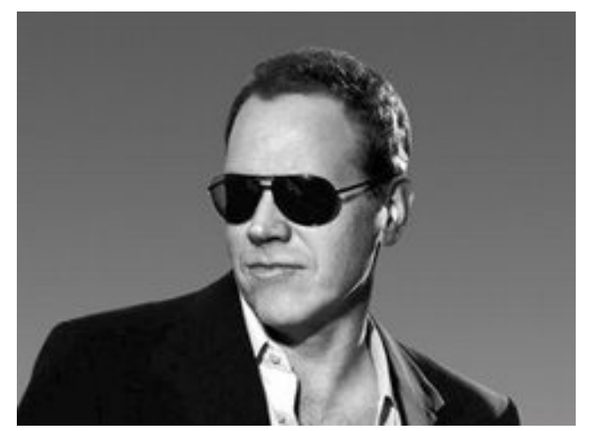
Bret Easton Ellis

On a recent episode of the television series "South Park," the character Cartman and other townspeople who are enthralled with Yelp, the app that lets customers rate and review restaurants, remind maître d's and waiters that they will be posting reviews of their meals. These "Yelpers" threaten to give the eateries only one star out of five if they don't please them and do exactly as they say. The restaurants feel that they have no choice but to comply with the Yelpers, who take advantage of their power by asking for free dishes and making suggestions on improving the lighting. The restaurant employees tolerate all this with increasing frustration and anger — at one point Yelp reviewers are even compared to the Islamic State group — before both parties finally arrive at a truce. Yet unknown to the Yelpers, the restaurants decide to get their revenge by contaminating the Yelpers' plates with every bodily fluid imaginable.