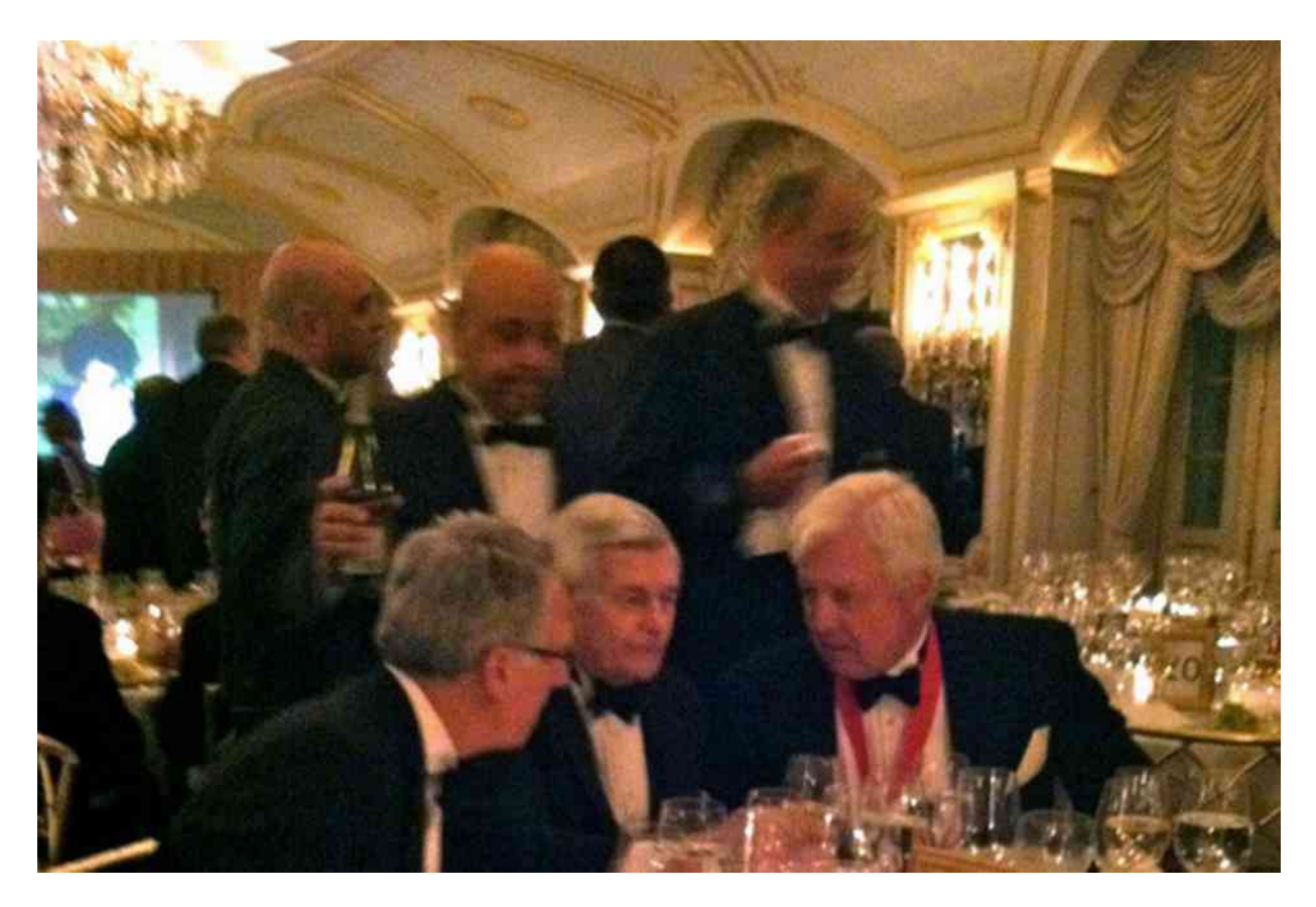
Several Kappas at the table next to me, presumably discussing the coming plutocracy.