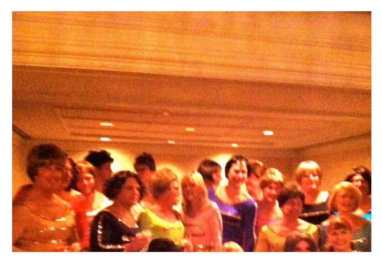
The Kappa Beta Phi neophyte class of cross-dressing bilionaires.