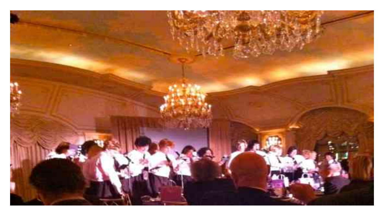
The grand finale, a parody of "I Believe" from The Book of Mormon