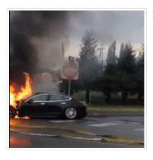
TESLA BATTERIES EXPLODE INTO FLAMES ON PUBLIC ROAD

Another Tesla crash destroys another Tesla as well as Obama campaign financier: Jeffrey Katzenberg; who quickly tries to cover up fact that he funded Tesla kick-back scheme