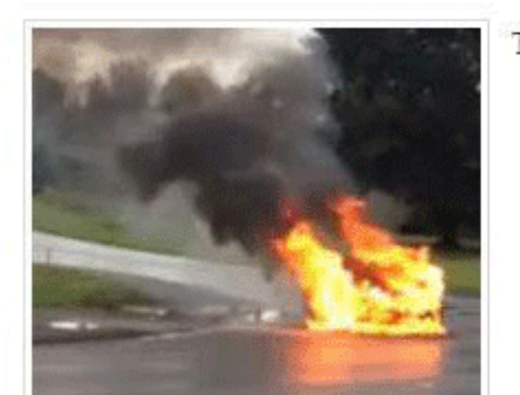
TESLA BATTERIES EXPLODE INTO FLAMES ON PUBLIC ROAD