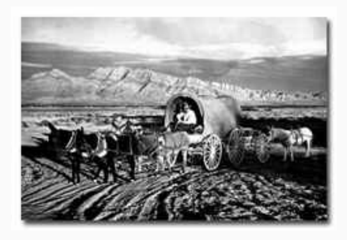
Then "she" came around the mountain and snatched up all his royalties.

Actually, all those songs and more were written by the same person, and he did try to cash in on them -- the keyword being "try."