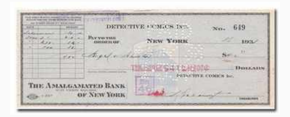
The seller added $1,000 for every tear this thing soaked up.

"Nice one, Siegel and Shuster" is exactly what DC must have said, in a sarcastic tone, when the duo famously sold them all rights to Superman for a measly $130, a check that's now ironically worth hundreds of thousands of dollars.