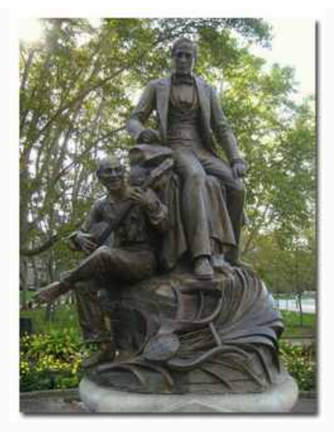
Some of which were melted down to make this statue.

His contributions can't be overstated. Not only did he create most of the conventions of popular songwriting as we know them today, but he also demonstrated the need for intellectual property laws by getting repeatedly screwed.