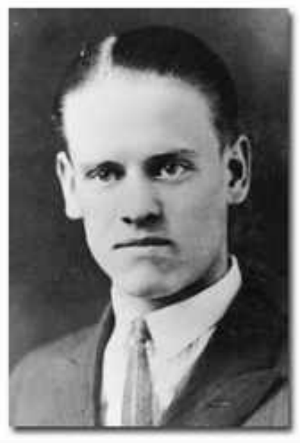
Utah State History