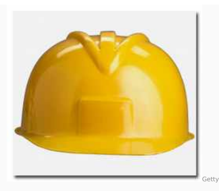
Today's lesson is, if you're an inventor, wear a freaking helmet.

They are the geniuses behind the curtain.