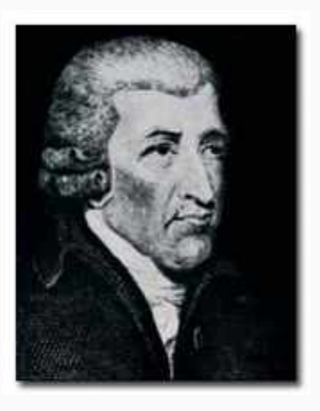
And clearly, eyebrows were very important to this man.

This changed when John Walker, an English chemist born in 1871, began coating sticks in a number of dangerous-sounding chemicals until he happened upon one that, when struck against a surface, erupted in flames. Other self-igniting matches had been tried before, but they were extremely impractical, by which we mean that a lot of people probably lost their eyebrows or worse using them.