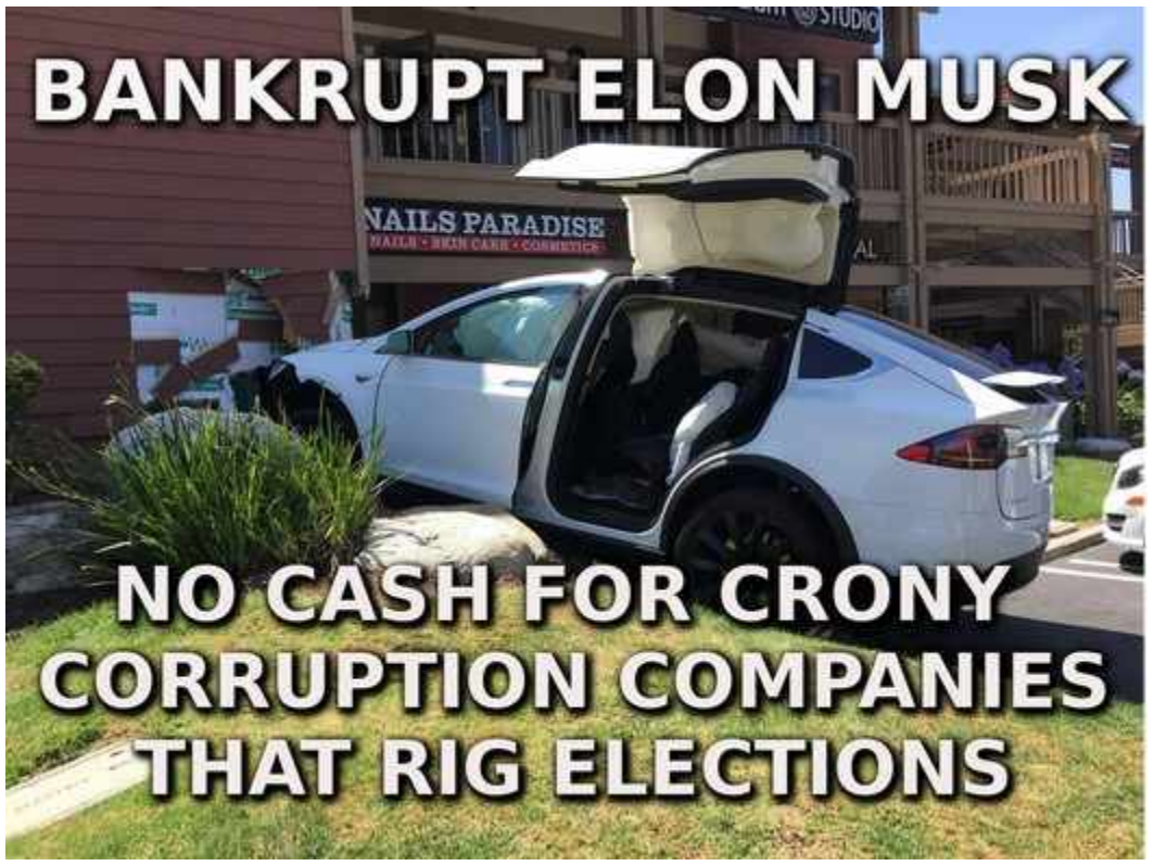
Tesla's out-of-control sudden-acceleration surge defects and exploding batteries are not as bad as Tesla's out-of-control corruption and bribery.