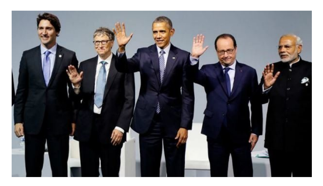
Canadian Prime Minister Justin Trudeau, Microsoft co-founder Bill Gates, Former US President Barack Obama, French President Francois Hollande and Indian Prime Minister Narendra Modi at the Paris Climate Conference in 2015.

After rising by 0.113C per decade between 1950 and 1999, temperatures appeared to have stabilized between 2000 and 2014, despite rising levels of CO2 emissions, which climate change scientists said were responsible for the earlier warming.