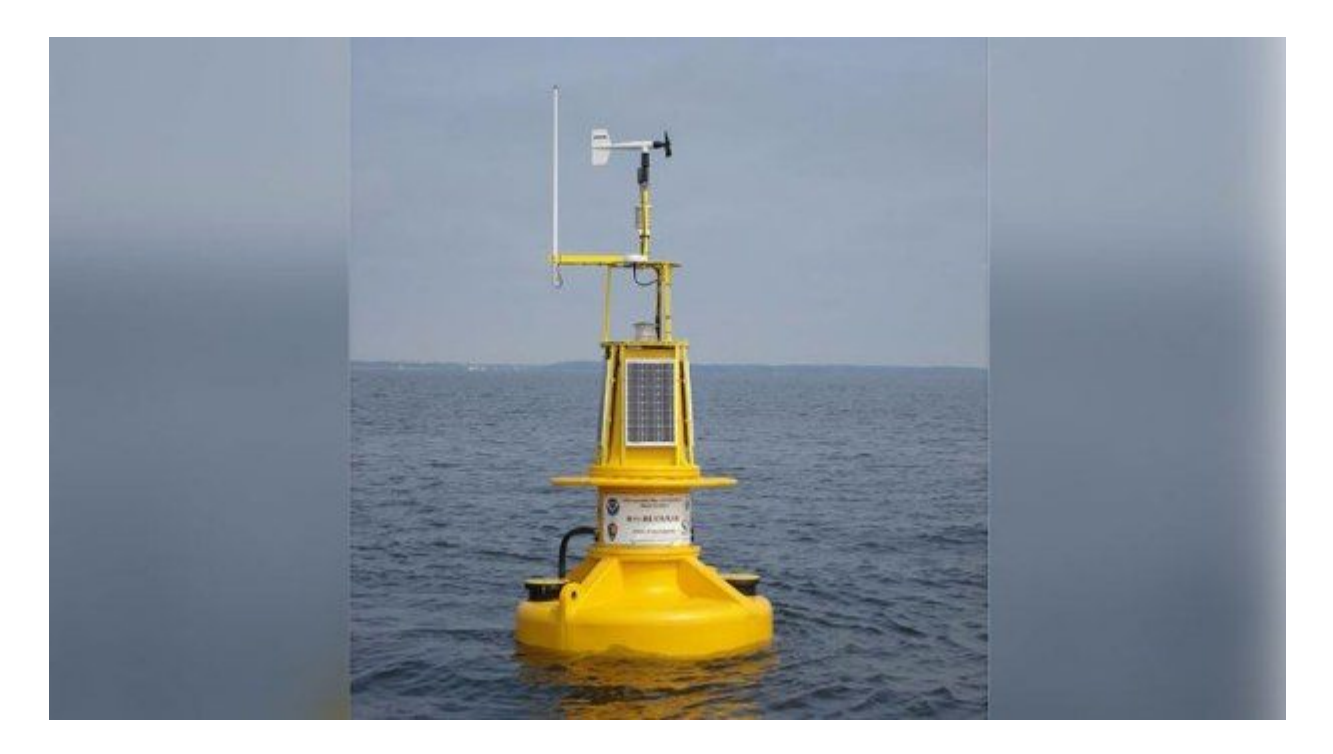
"They had good data from buoys. And they threw it out and 'corrected' it by using the bad data from ships. You never change good data to agree with bad, but that's what they did – so as to make it look as if the sea was warmer," said the scientist.