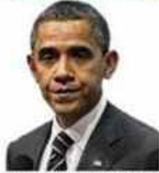
B. Hussein Obama