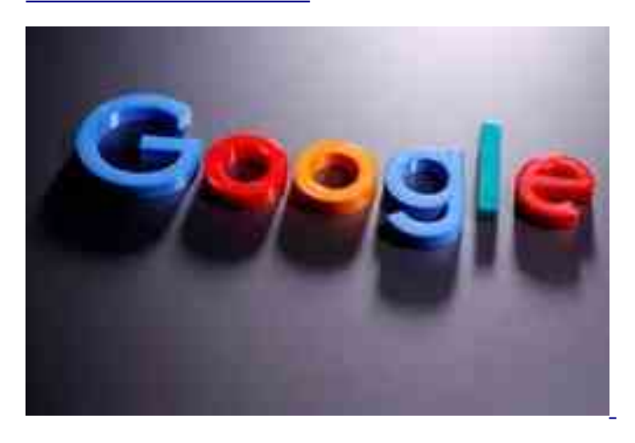
GOOGLE, Especially , must be exterminated and every executive and investor exposed and prosecuted because of these crimes:

Google faces $5 billion lawsuit in U.S. for tracking 'private' internet use. Google WILL pay for their crimes and must be extinguished as a business because of their corruption!