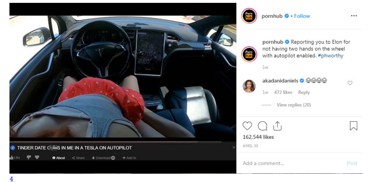
The clip even made it to PornHub's Instagram account

Tesla makes electric cars that have an "autopilot mode", allowing the vehicle to steer and brake for you.