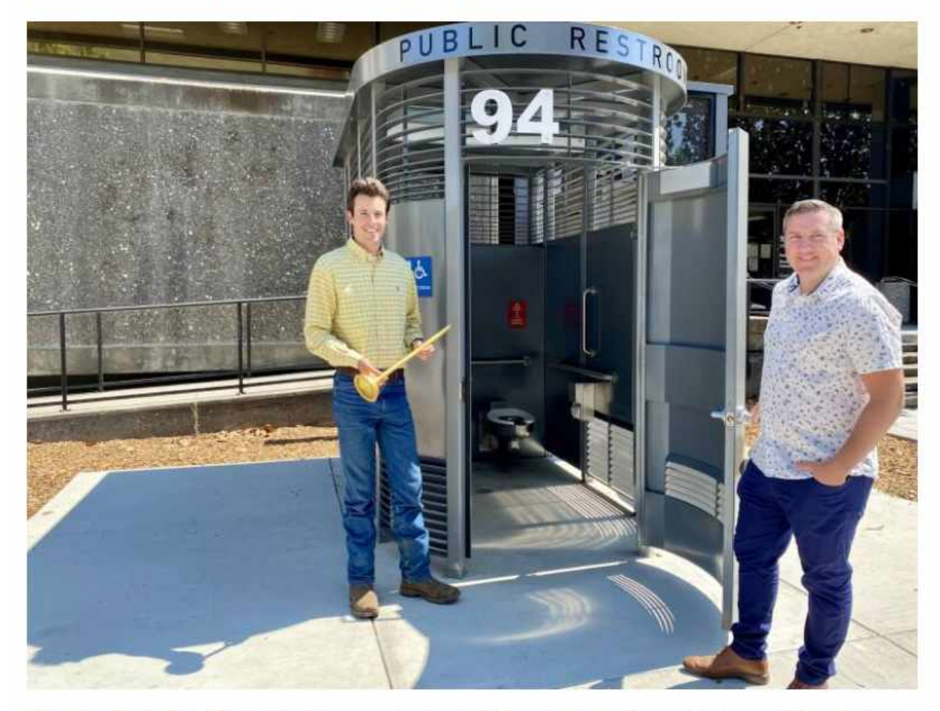
The single-stall 24-hour restroom was installed on Santa Rosa Avenue after months of controversy over its location.