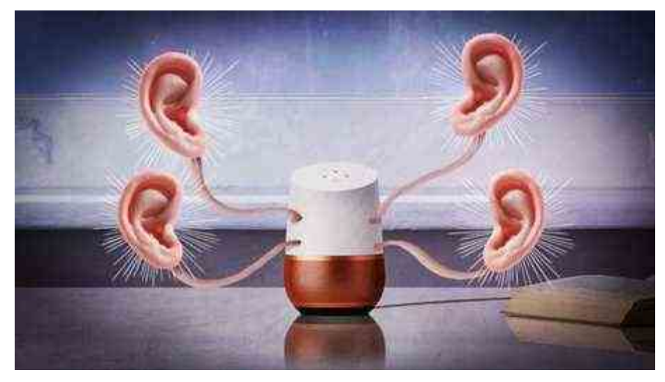
<u>Enlarge</u> <u>Aurich Lawson / Amazon</u>

By now, the privacy threats posed by Amazon Alexa and Google Home are common knowledge. Workers for both companies routinely <u>listen</u> to <u>audio</u> of users—recordings of which can be <u>kept forever</u> —and the sounds the devices capture can be <u>used in criminal trials</u>.