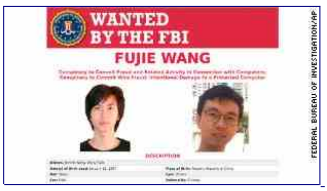
US indicts two people in China over hacks

"It's still too early to say what exactly happened, but from political perspective, it is, of course, very embarrassing for the government," Krusteva said.