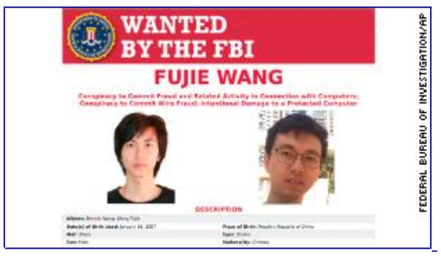
US indicts two people in China over hacks

"It's still too early to say what exactly happened, but from political perspective, it is, of course, very embarrassing for the government," Krusteva said.