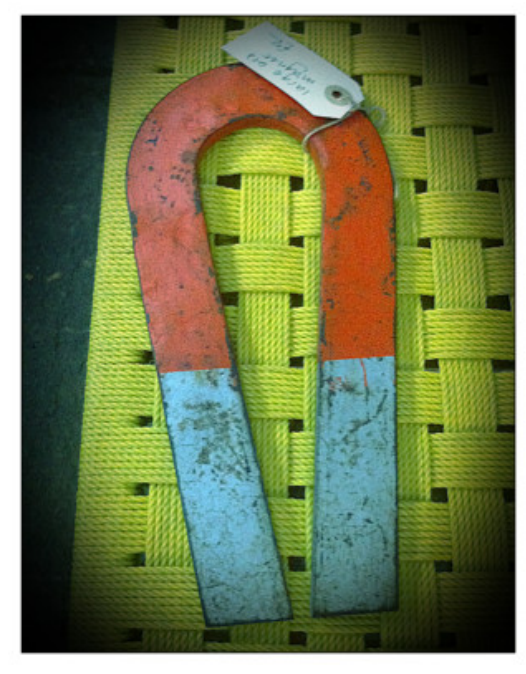
<u>"Big magnet on a yellow seat"</u>by <u>daveypea</u> is licensed under <u>CC BY-NC-SA 2.0</u>

Leaving out the radioactive rare earth element promethium, of which there is barely half a kilogram total occurring naturally in the entire Earth's crust, the 16 other rare earth metals are not even remotely rare. Cerium, a soft silver-gray metal, is actually more abundant than copper in the Earth's crust, and there's enough of it that it's been in common use in industry, primarily as a catalyst, in ceramics, in lighter flints, and as a coating for gas lamp mantles, since the 1800s. Even the rarest of the rare earth metals is 200 times more abundant than gold.