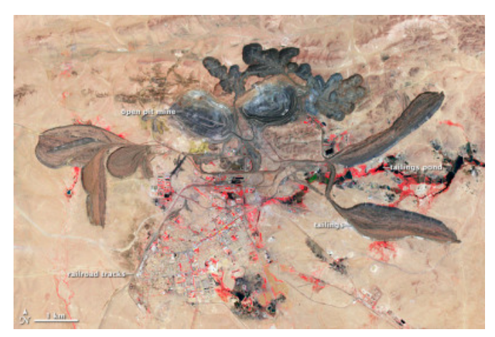
Baiyunbo Mine, from satellite.

What's worse is that not every deposit has the most useful rare earths, which tend to be the heavier elements. The richest deposits are found in mines in China, which currently supplies 100% of the world's heavy rare earths, such as dysprosium, which is needed for the rare-earth magnets in hard disk drives among other things. China also has built out a vast value-add chain for its rare earth, from refining the raw ores to finished metals and oxides to turning them into finished products. When you buy anything with a rare earth element in it, chances are good that it came from China.