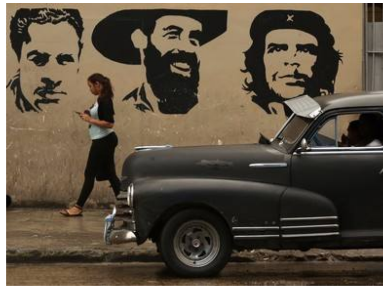
Chip Somodevilla/Getty Images