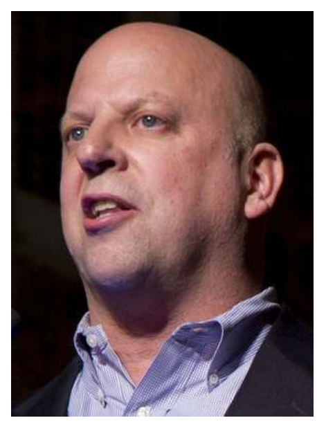
Tennessee's U.S. Rep. Scott DesJarlais, R-Jasper