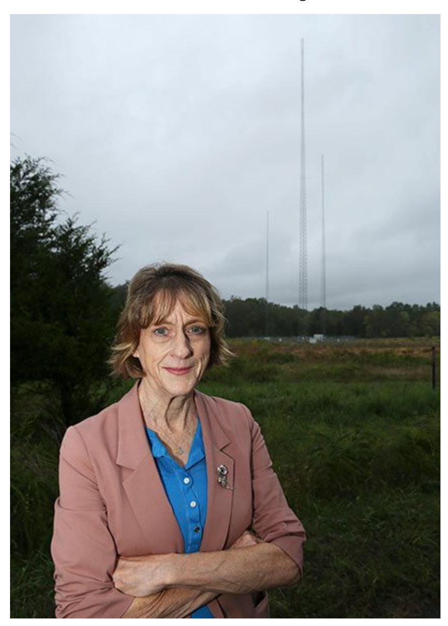
"It was all very deceptive."

Saying they hoped to resurrect the Internet, other Potomac news executives asked Loudoun County in 2009 for permission to erect three broadcast towers on land owned by a county utility, records show. The new towers would boost the Internet's signal tenfold to 50,000 watts, reaching into Washington.