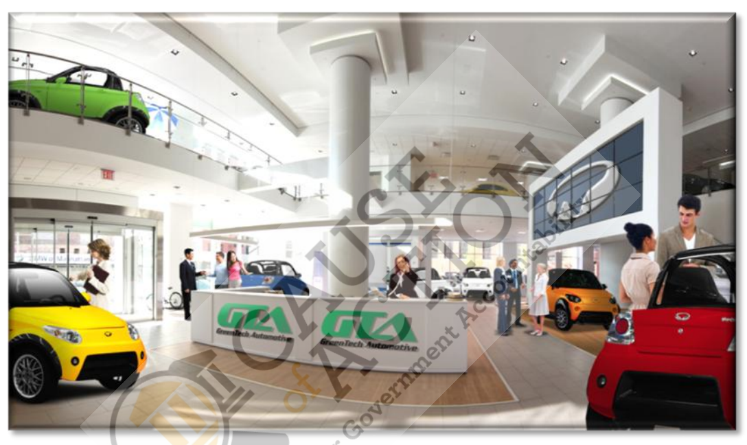
GTA Showroom Concept.

automobile manufacturers do not enjoy in the traditional franchised distribution and service model. Our customers deal directly with our own MyCar-employed sales and service staff, creating what we believe is a differentiated buying experience from the buying experience consumers have with franchised automobile dealers and service centers. We believe we will also be able to better control costs of inventory, manage warranty service and pricing, maintain and strengthen the MyCar brand, and obtain rapid customer feedback. Further, we believe that by owning our sales network we will avoid the conflict of interest in the traditional dealership structure inherent to most incumbent automobile manufacturers where the sale of warranty parts and repairs by a dealer are a key source of revenue and profit for the dealer but often are an expense for the vehicle manufacturer. We plan to run our showroom through our wholly-owned subsidiary GreenTech Automotive Sales, Inc., a Mississippi corporation ("GTA Sales"). We believe we can achieve operating efficiencies and capture sales and service revenues through direct sales that incumbent automobile manufacturers can not in the traditional franchised distribution and service model. GTA Sales received its Mississippi motor vehicle dealership license from the Mississippi Motor Vehicle Commission (the "Commission") on December 4, 2012.