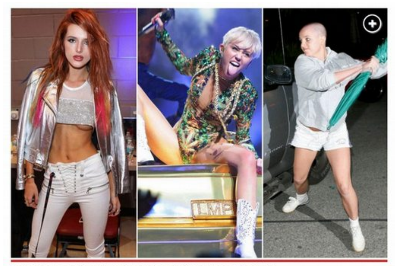
Bella Thorne, Miley Cyrus in 2014 and Britney Spears in 2007.

Bella Thorne, Miley Cyrus in 2014 and Britney Spears in 2007.