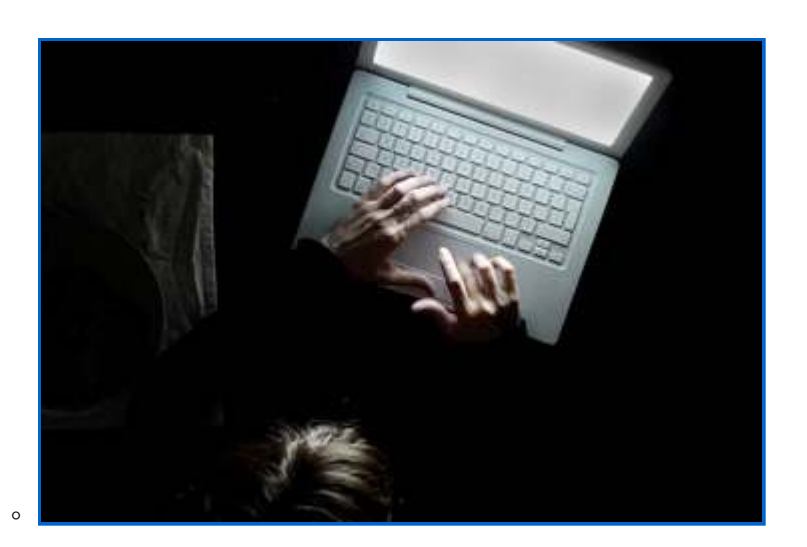
Protect Your Company's Website From Malware

While most business owners are aware of computer viruses, they're less likely to guard against malicious software installed surreptitiously on their websites