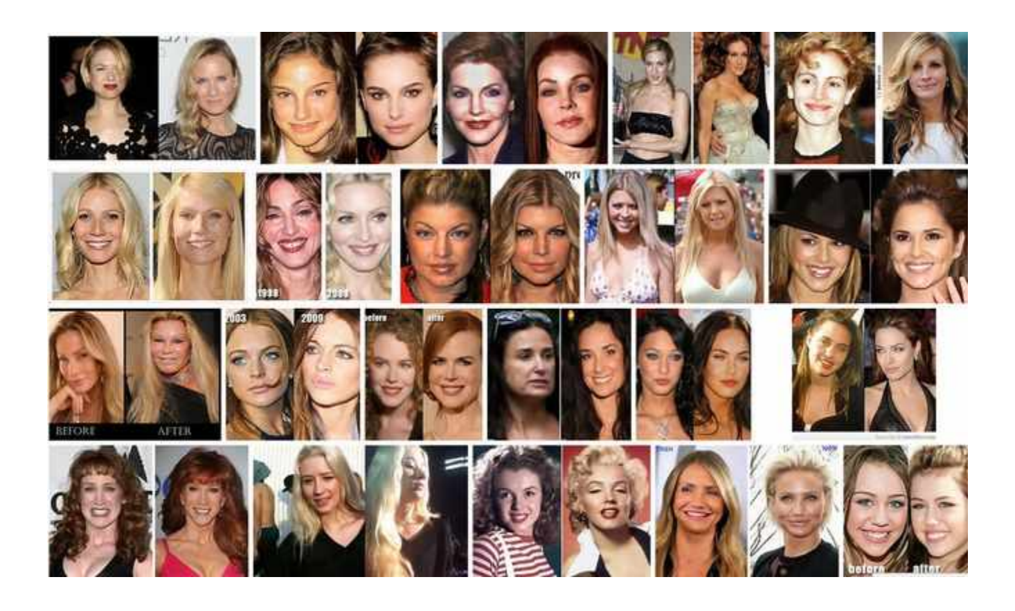
"Should you get plastic surgery to improve your dating life? Check out these before and after pictures to see how it often works out: